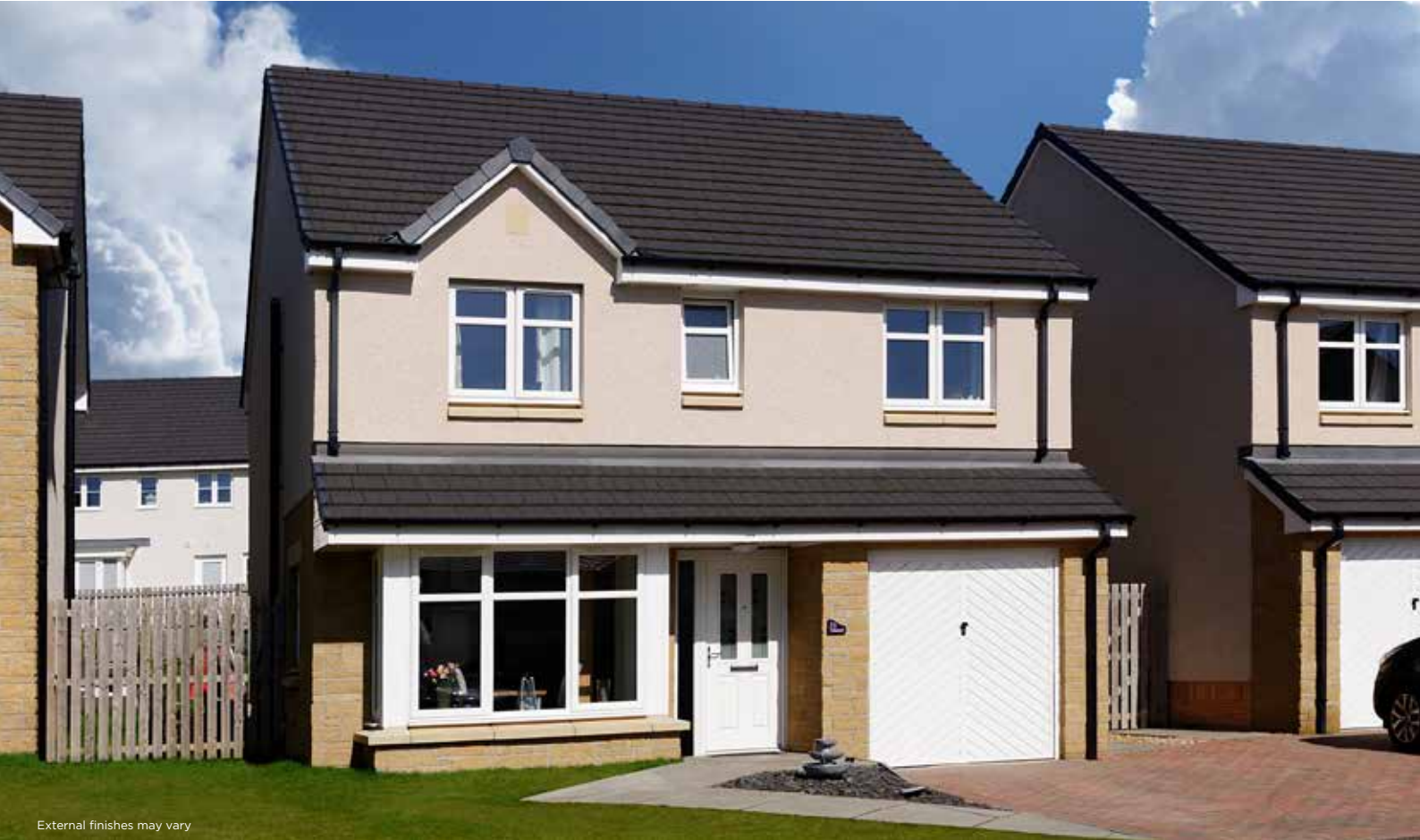
External finishes may vary